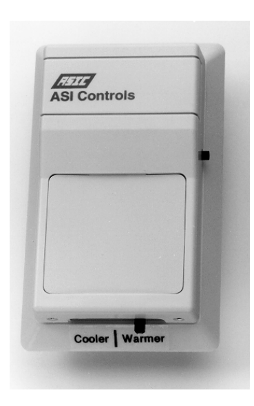
WS-RSO Wall Sensor